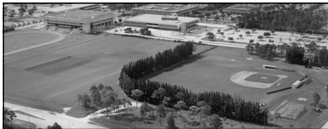
Kendall Campus Baseball Facility